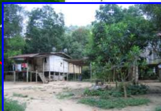
Ulu Senagang & Mongool Baru

Global significance of ecosystem functions, biodiversity, and very important as water catchment area for west coast and interior plain of Sabah.