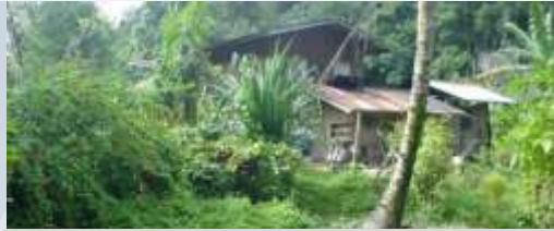
Ulu Papar CUZ